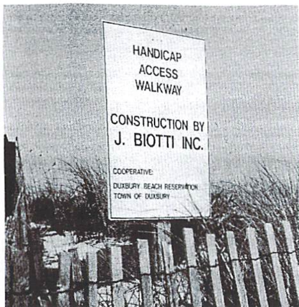
The new handicap access walkway on Duxbury Beach which opened on Sunday, July 14 is the result of cooperation of the Duxbury Beach Reservation and the Town of Duxbury (Municipal Commission on Disabilities and the Harbormaster Department).